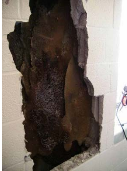
Fig 2. Honey bee comb in cement block wall. Comb removal is an important step in honey bee management in order to avoid secondary pests such as the wax moth and the small hive beetle.