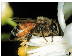
Fig 1. A honey bee collecting pollen.

Although insects are present year round in Florida, summertime is when insect activity is usually at its peak. Late summer and fall are when stinging insect populations are most active, and when stings are most likely to occur. To prepare you for stinging-insect season, this newsletter will be the first of a three-part series on stinging insects. In this issue we will focus on the identification and management of bees.